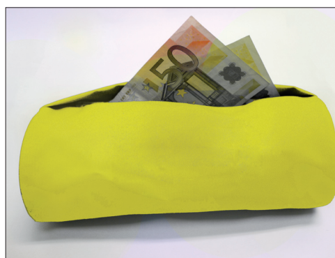
Cash bag NW90 with zip closure